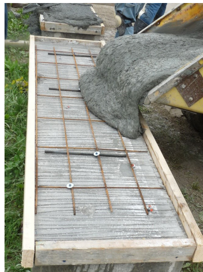
Concrete slab specimen with wire mesh being overlaid with UHPC

Three slab specimens representing regular concrete bridge decks in Iowa were constructed. The size of each slab specimen was 2 ft by 8 ft, and the thickness of the normal concrete slab was 9 in. Two of these slab specimens were brought to the field and overlaid with 1.5 in. thick UHPC, which made the slab thickness 10.5 in. Both slabs included wire mesh reinforcement in the overlay. A UHPC overlay was not applied to the remaining specimen.