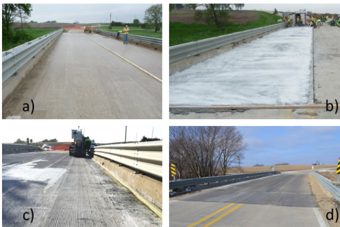
Mud Creek Bridge: (a) deck before the overlay was placed, (b) UHPC overlay placed in one lane, (c) girding of the surface, (d) completed deck

A UHPC overlay thickness of 1.5 in. was chosen for the entire bridge deck. Welded wire reinforcement (wire mesh) was placed in one lane at the pier locations to evaluate the usefulness of such reinforcement in the negative moment region and the ease with which such reinforcement could be used within the overlay. Once the UHPC hardened, the surface was ground and grooved to give an appropriate roughness for vehicular traffic.