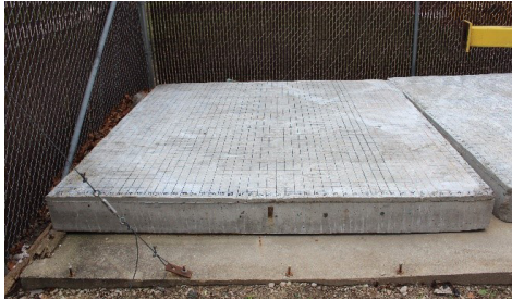
Slabs overlaid with UHPC

Two 8 ft x 8 ft x 7.75 in. concrete slabs were designed and constructed with reinforcement details similar to those of bridge decks to support dead and live loads. One slab had an exposed aggregate surface (Slab A) and the other had a broom-finished surface (Slab B) with a surface roughness of about 1/8 in. (3 mm). A 1.5 in. thick UHPC overlay was then placed on top of both slabs.