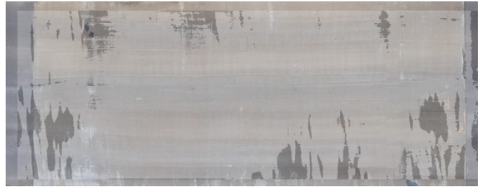
Infrared thermal imaging results for the entire Mud Creek Bridge deck

Infrared thermal image scanning was also performed to assess the delamination potential of the UHPC overlay.