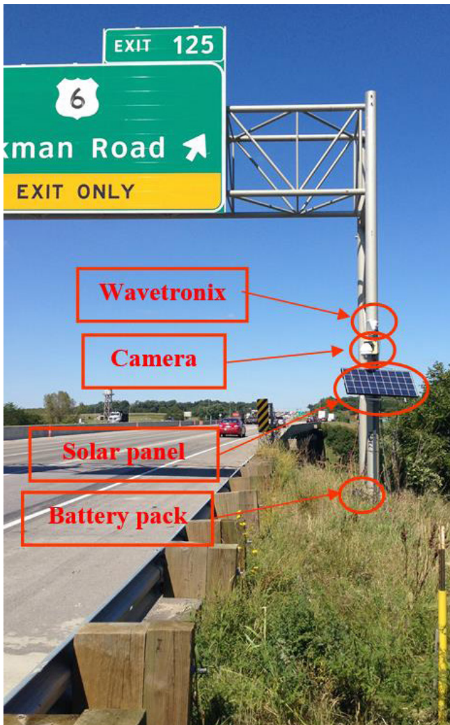
Wavetronix SmartSensor HD detector and camera setup for measuring headway/time gap

To obtain headway/time gap data, timestamped individual vehicle data, especially speed, vehicle class, and lane assignment data, were collected using Wavetronix's SmartSensor HD side-fired radar detectors.