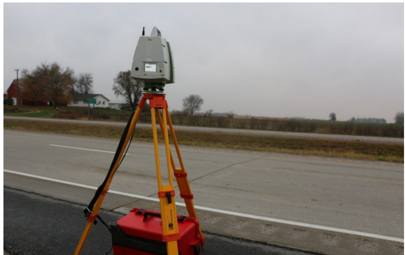
LiDAR device utilized in this study

To better understand curling and warping behavior of PCC pavements in Iowa, research efforts are needed to collect data from Iowa pavements and document the true degree of curling and warping.