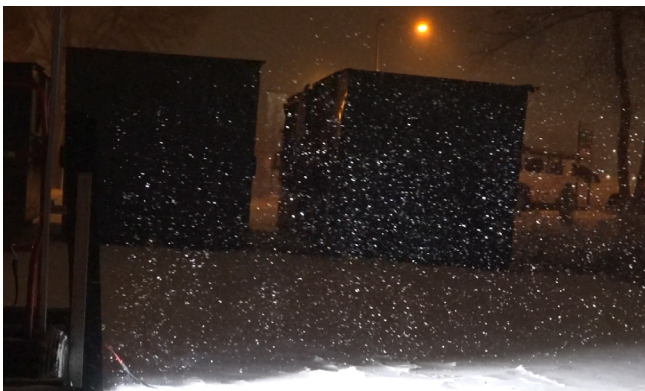
LSPIV test setup on a flat rooftop (top) and sample image (bottom)