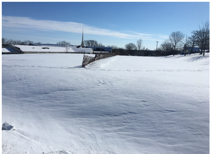
East view of in situ snow fence site in Shueyville, Iowa, looking upwind

Blowing and drifting snow on roadways leads to ice formation on the roads, decreased visibility and increased safety risks for drivers, and ultimately more accidents. Snow fences are commonly used to mitigate snow drift on roadways by slowing the speed of drifting snow and promoting snow deposition downwind of the fence.