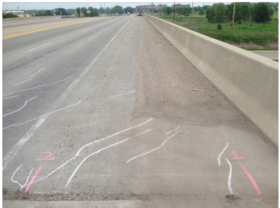
Diagonal cracks at the corner of the deck of Bridge #605220

The primary objective of this project was to determine the effect of bridge width on bridge deck cracking. Other factors, such as bridge skew, girder spacing and type, abutment type, pier type, and number of bridge spans, were also studied.