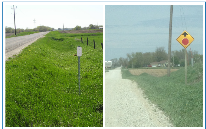
Sample Mitigation: New, highly-reflective delineators and signs installed in Dallas and Story counties