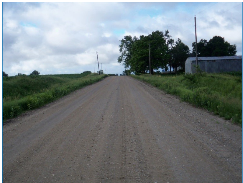
Portion of 530th (Grant) Avenue between Ames and Gilbert, Iowa

Among the major contributing factors to crashes on these roads were higher speeds and younger driver involvement. The final 2010 report included recommendations for crash mitigation, such as enhanced law enforcement, younger driver education, and several low-cost engineering improvements, including upgraded signing, particularly at horizontal curves, and roadside delineation.