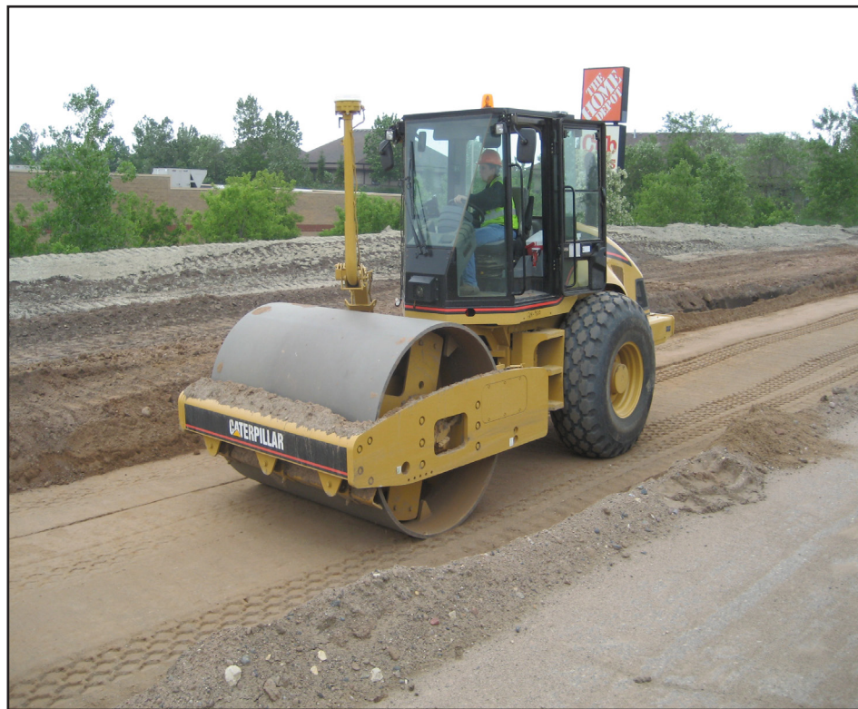
Figure 1. Caterpillar CS563 padfoot roller with CMV measurement system on TH 36 project (White et al. 2009)