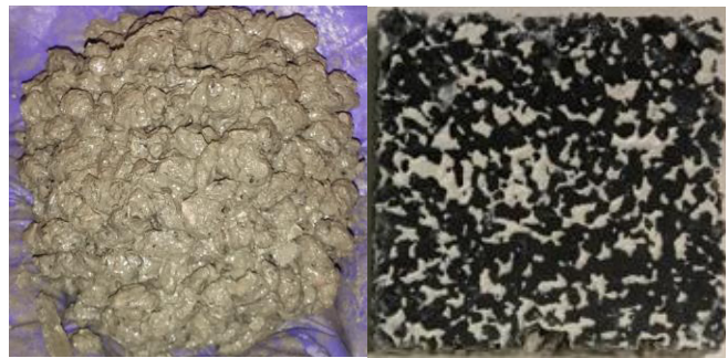
Hand-formed ball of the pure Portland cement specimen for the workability test (left) and cross-section of the 15% fly ash specimen prepared for testing with the RapidAir method and the flatbed scanner method (right)