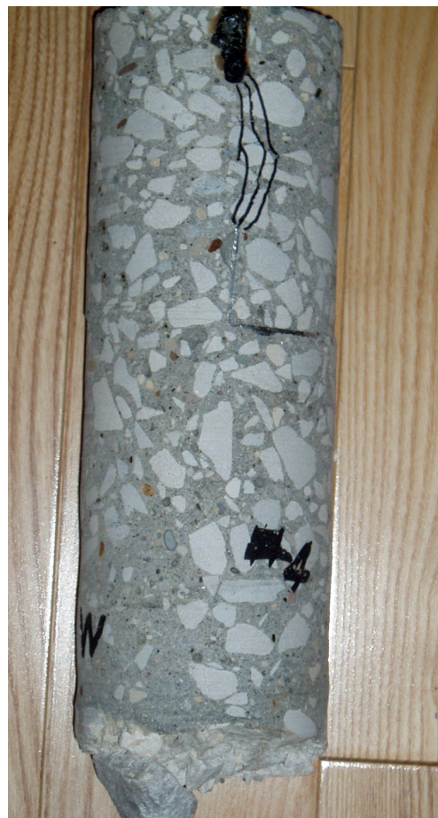
Core sample showing a crack extending from the joint former