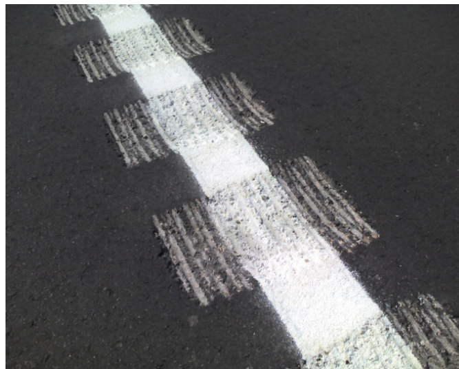
A four-inch edge line rumble stripe placed on a rural highway in Iowa

Single-vehicle ROR crashes are the most common crash type on rural two-lane Iowa roads. Rumble strips have been proven effective in mitigating these crashes, but these strips are commonly installed in paved shoulders adjacent to higher-volume roads owned by the State of Iowa. Edge “Rumble stripes,” which are a combination of conventional rumble strips with a painted edge line placed on the surface of the milled area, along the lane edge, may be an effective, relatively low-cost method that can be used to reduce the number of ROR crashes on lower-volume paved rural roads owned by local agencies that commonly do not have paved shoulders.