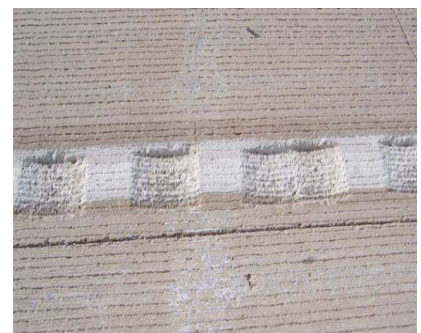
Similar wear for edge line in rumble stripe and flat section