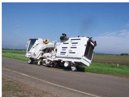
Milling machine tipping on low side of elevated horizontal curve