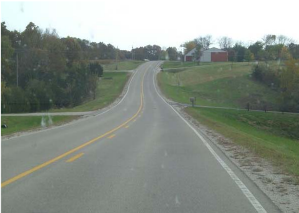
Figure A.2. County Road X-23, curvilinear alignment and pavement markings