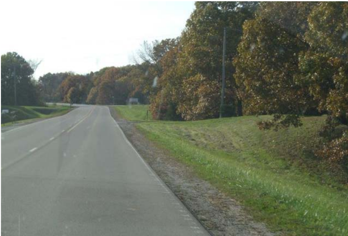
Figure A.8. County Road W-62, alignment and pavement markings