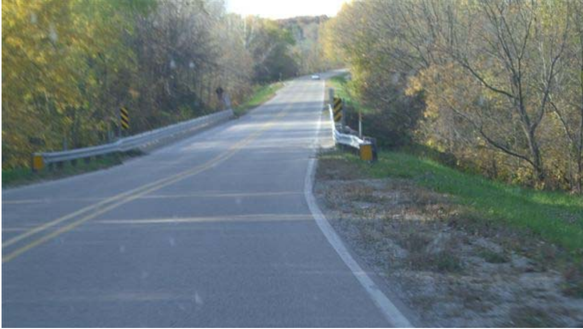
Figure A.9. County Road W-62, guardrail and delineation at newer bridge