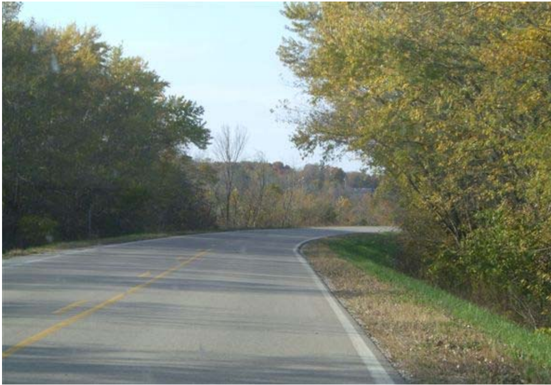
Figure A.10. County Road W-62, close proximity of vegetation along horizontal curve