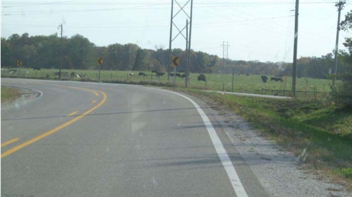
Figure A.5. County Road X-23, chevron installation along horizontal curve