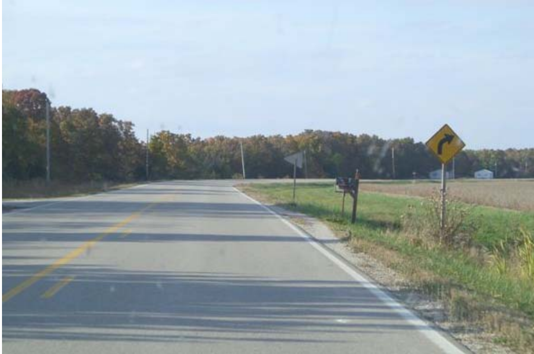
Figure A.11. County Road W-62, curve sign and pavement markings