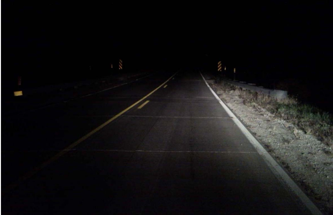
Figure A.7. County Road X-23, pavement markings and bridge delineation at night