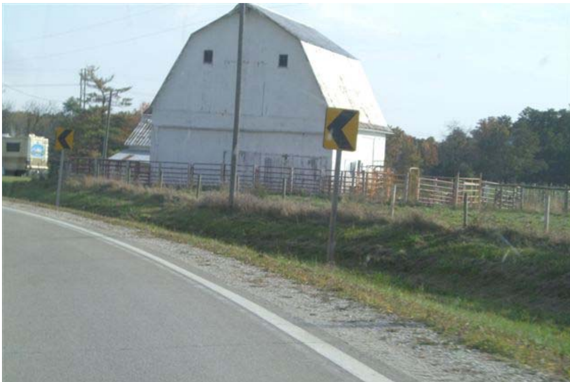
Figure A.6. County Road X-23, closer view of chevrons