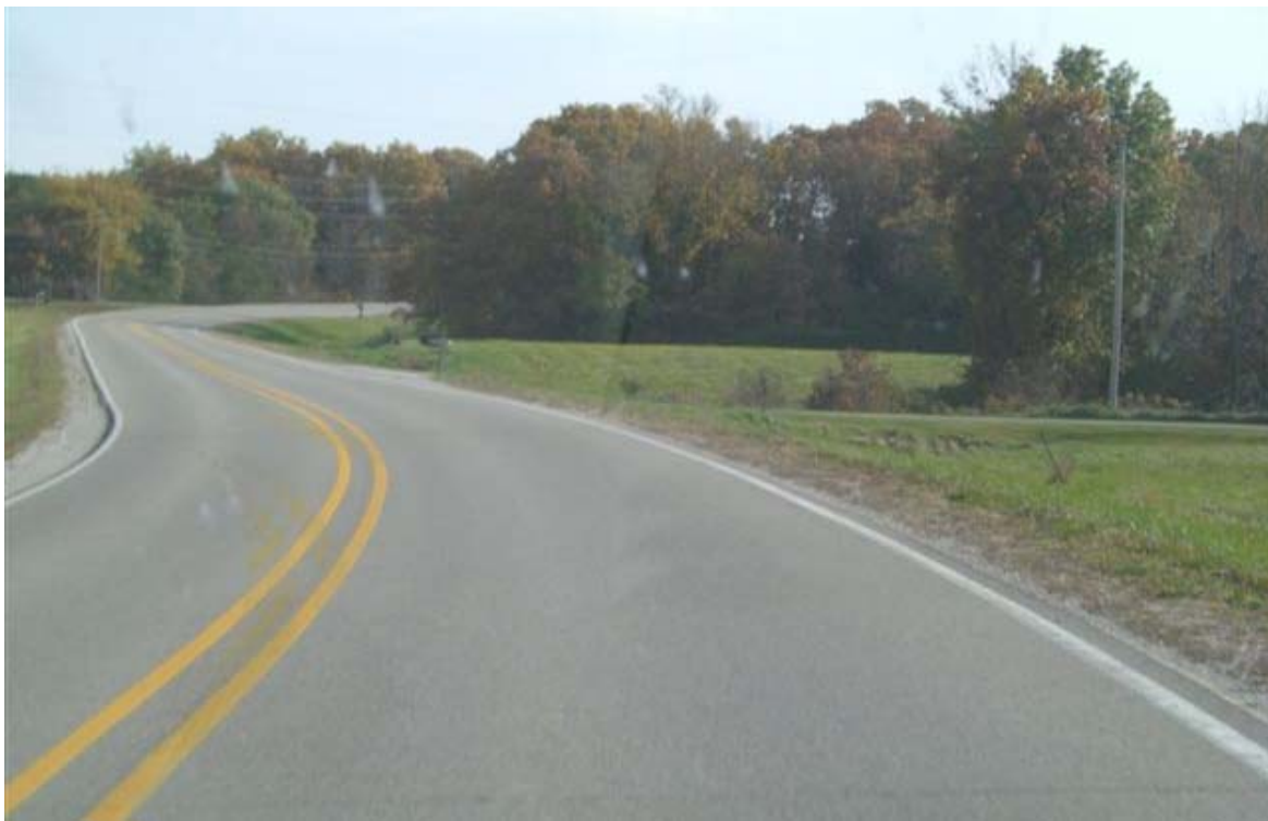
Figure A.4. County Road X-23, reverse curvature alignment