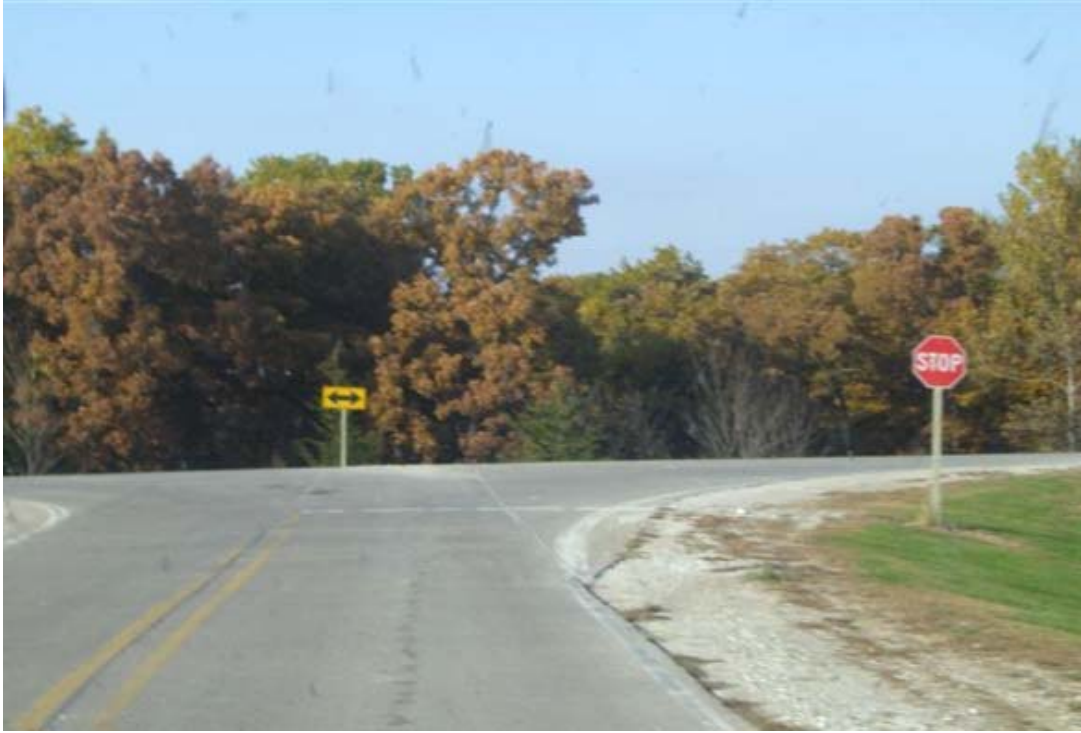
Figure A.13. County Road W-62, stop sign and double-arrow warning sign at side road intersection approach