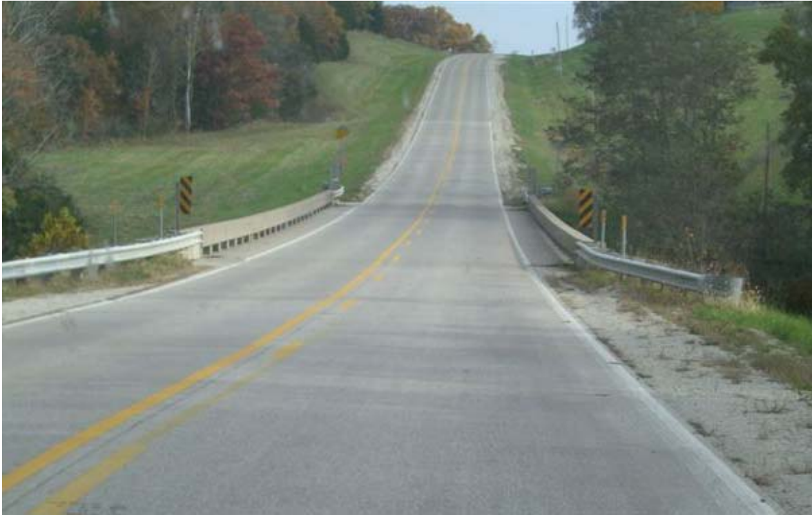
Figure A.3. County Road X-23, guardrail and delineation at newer bridge