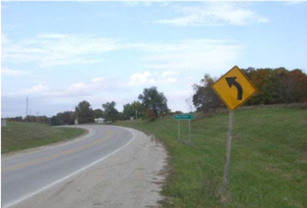
Figure A.1. County Road X-23, curve sign just northerly from IA 2 intersection