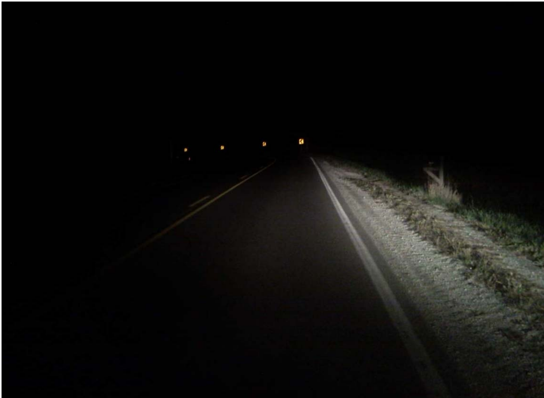
Figure A.14. County Road W-62, chevrons along horizontal curve at night