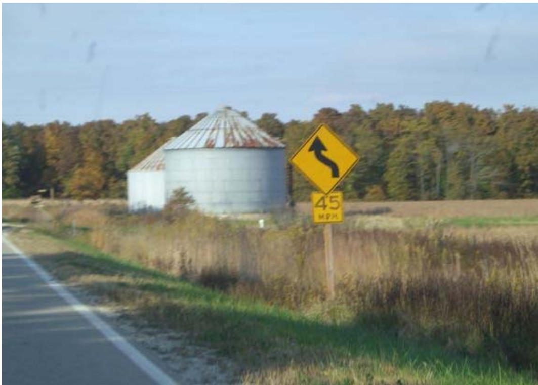
Figure A.12. County Road W-62, reverse curve sign and advisory speed plaque