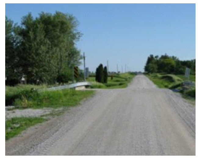
LVR concrete bridge in Iowa with continuous guardrail, not included in the state inventory