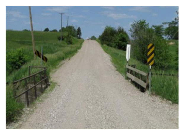
LVR concrete bridge with timber and metal bridge rails and damaged signing

Bridge rail and approach guardrails provide safety to drivers by shielding hazardous roadside objects and redirecting vehicles to the roadway. However, guardrails can increase a bridge's initial and maintenance costs while adding another object that vehicles may strike. Additionally, the use and type of rail systems on non-national highway systems—which include LVRs—is left to state or county discretion.