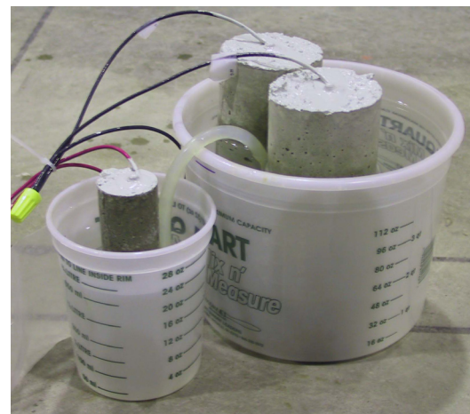
Typical as-constructed Rapid Macrocell ACT