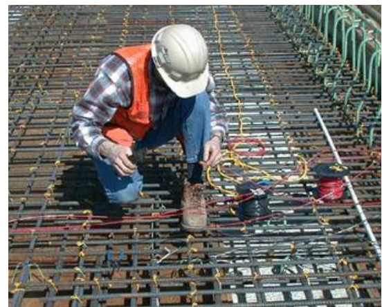
Extending lead wires for data measurement