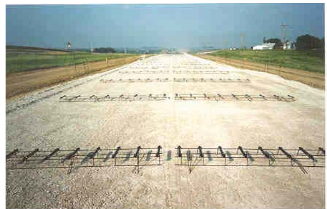
Figure 2. Placed wheel path baskets