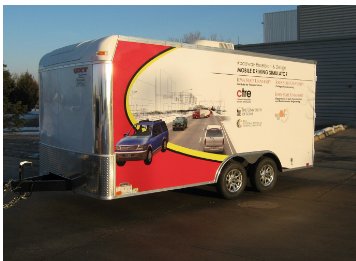
CTRE simulator trailer

Interactive driving simulation provides an ideal environment for human factors related research and safety evaluations on topics such as speed selection, lane selection, gap acceptance, sign comprehension and compliance, and work-zone driving performance. Driving simulation enables these kinds of safety