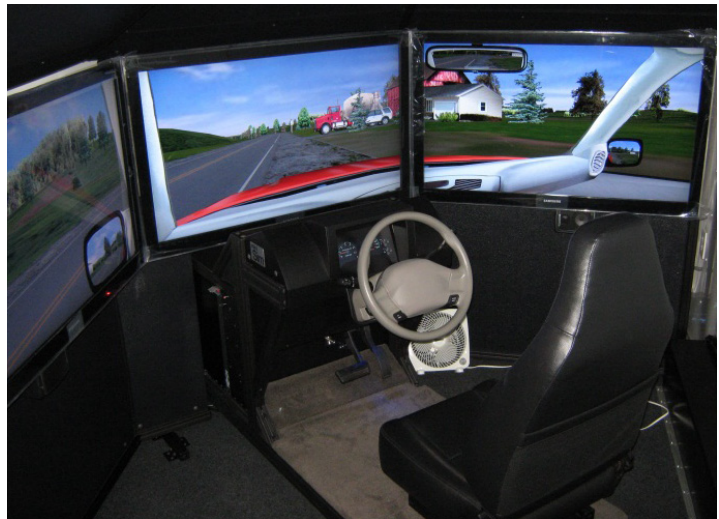
Simulator view inside the trailer

A video showing the steps using the converter tool and subsequent driving in the simulator is available at www.youtube.com/watch?v=beWGea255s0&feature=youtu.be .