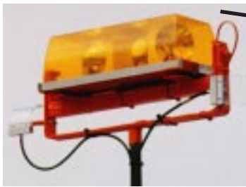
high intensity warning lights Tri-State Signing Ontario, Canada