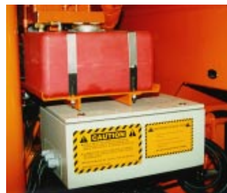
engine power booster and alternative tank Fosseen Manufacturing Radcliffe, Iowa