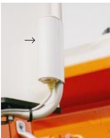
air/pavement temperature sensor Sprague Company Canby, Oregon