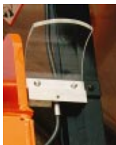
high-intensity warning lights Tri-State Signing New Hampton, Iowa

Iowa's prototype truck O'Halloran International Inc., Des Moines, Iowa (truck vendor); Bristol Company, Broomfield, Colorado (material applicator)