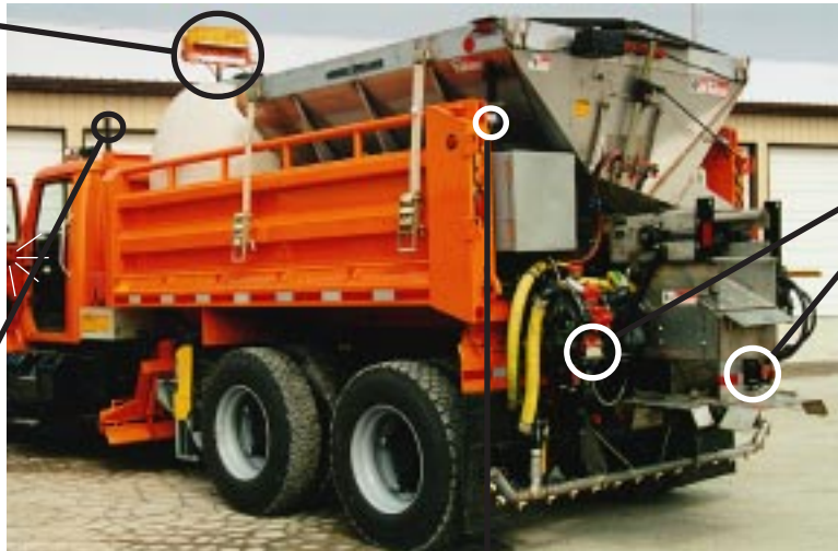
reverse obstacle sensors Global Sensor Systems Ontario Canada