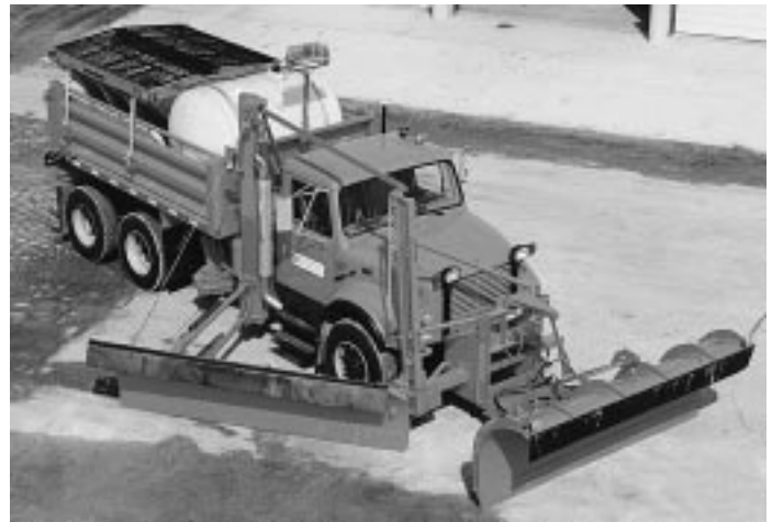
It started as a wish list: the advanced technology maintenance vehicle.