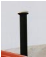
global positioning system Rockwell International Cedar Rapids, Iowa