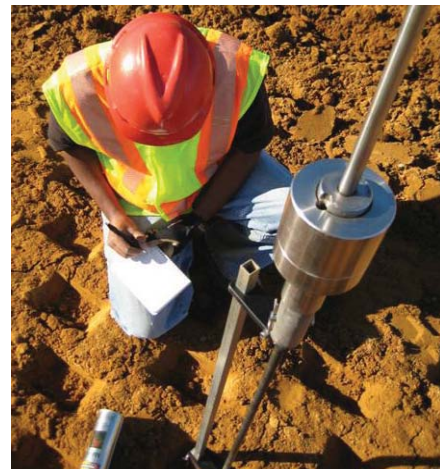
Dynamic cone penetrometer testing