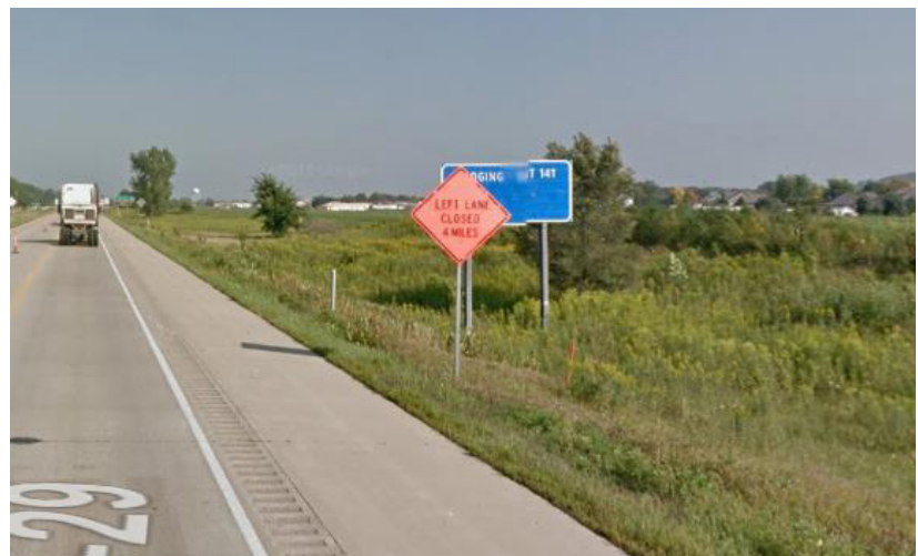
Google Street View image in a work zone near Sergeant Bluff, Iowa