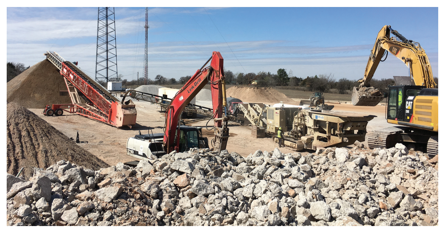
Gary Fick, Trinity Construction Management Services, Inc. Figure 5. Typical concrete pavement crushing and stockpiling operation

The same basic equipment used to process virgin aggregates also can be used to crush, size, and stockpile RCA (see Figure 5). However, the selection of crushing processes can affect the amount of mortar that clings to the recycled aggregate particles and, therefore, the properties of the RCA (as described below).