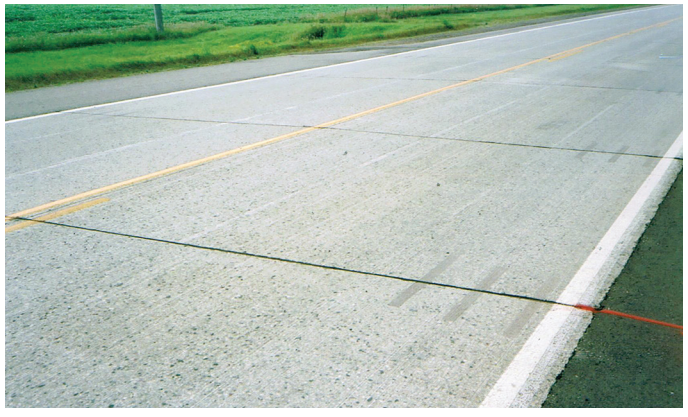
Mark B. Snyder Figure 4. US 59 near Worthington, Minnesota in 2006, after 26 years of service and 2004 rehabilitation

By 1985, portions of I-80 in eastern Wyoming had developed severe ASR damage. Concrete pavement recycling was determined to be a feasible and economical