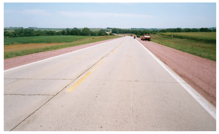
Mark B. Snyder Figure 2. US 75 near Rock Rapids, Iowa, in 2006 after 40 years of service and some rehabilitation

HMA (typically considered a contaminant in RCA concrete mixtures) in the lower paving lift.