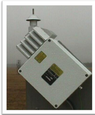
Figure 1. Rosemount 872C2 icing detector

The sensor uses a one-inch rod that is driven mechanically at a vibration frequency of 40 kHz. As ice accumulates on the rod, the added mass reduces the mechanical vibration. Circuitry in the system records the frequency changes and provides an interface to external data logging devices. Once the frequency reduces to a pre-set minimum due to ice accretion, a heating cycle is triggered to shed the ice from the vibrating rod. This permits a continuation of the ice accretion measurements.