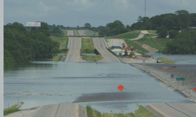
Flooded I-80 in 2008