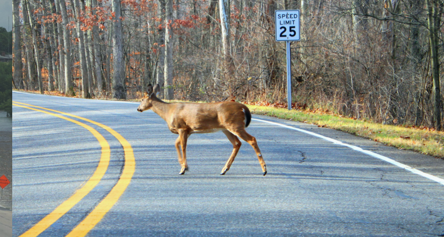
Mapping Iowa's deer corridors