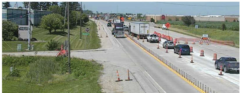
Traffic breakdown at a work zone site included in this project

The team used their observed field measurements to evaluate the HCM work zone capacity methodology.