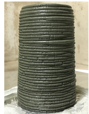
Printed sample of Mix 0.32-G20