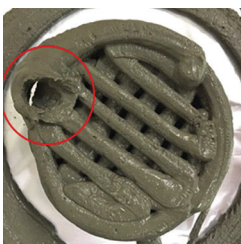
(a) Air bubble pop outs