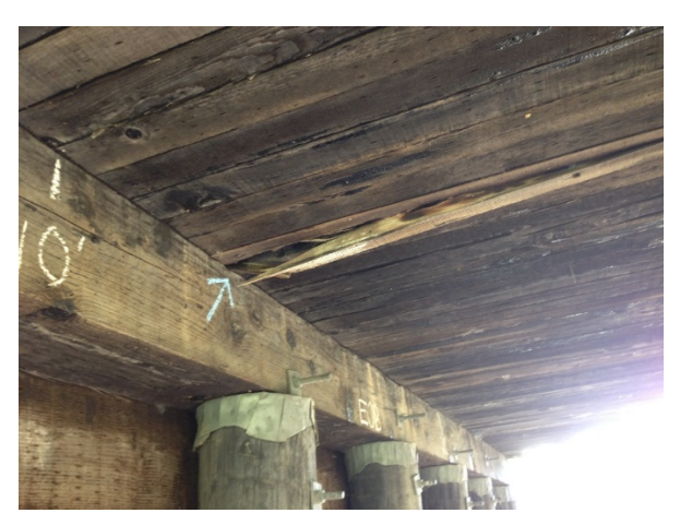
Fig. 13 Damage at longitudinal deck panel connection, Clarke 3

Other minor issues discovered in the visual inspection were that the EOB abutment cap was slightly rotated away from midspan and had slid back on the pile bearings slightly; in addition, the EOB abutment cap had checking and splitting on its interior face. Lastly, the transverse stiffener beam has signs of splitting/crushing at two of the interior thru bolt connection locations, but they were not significant at the time of this inspection.