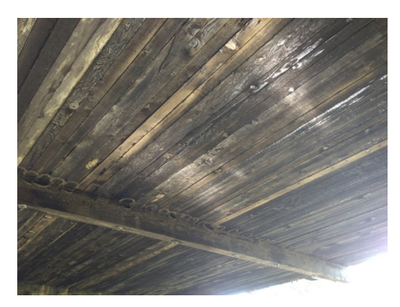
Fig. 7 Timber deck bridge underside view from Cluster 3 in Clarke County