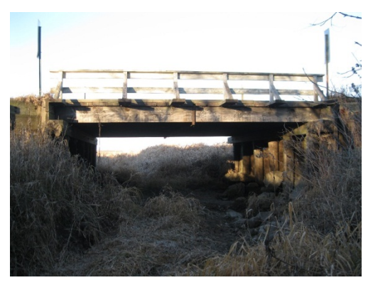
Fig. 2 Timber girder bridge elevation view from Cluster 1 in Bremer County

The five timber bridges located in Bremer County, Iowa were all single span, timber girder bridges with transverse timber plank decks and were located on secondary gravel roads. All five of the bridges were built between 1994 and 1997 and the superstructure elements consisted of Douglas-fir timber treated with creosote. Each bridge consisted of between 25 - 35 timber girders measuring 102 mm (4 in.) x 406 mm (16 in.) and the timber planks were 102 mm (4 in.) x 305 mm (12 in.) which were nailed to the tops of the girders. All of the bridges had timber abutments consisting of timber piles, plank backwalls/wingwall and timber caps and timber guardrails. The ends of the girders were typically nailed to the timber plank backwall as well as toe nailed to the solid timber abutment caps. See Figs. 2 and 3 for a typical bridge layout.