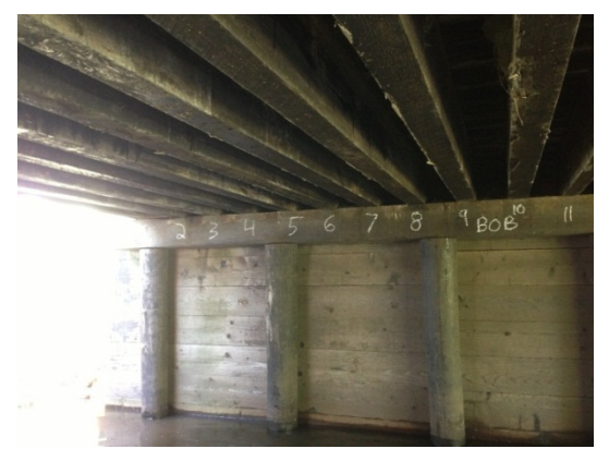
Fig. 5 Timber girder bridge underside view from Cluster 2 in Blackhawk County