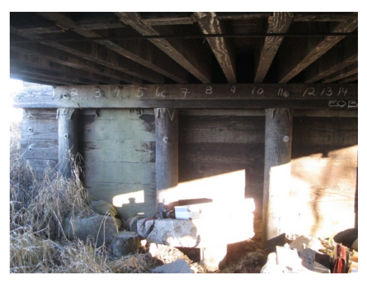
Fig. 3 Timber girder bridge underside view from Cluster 1 in Bremer County