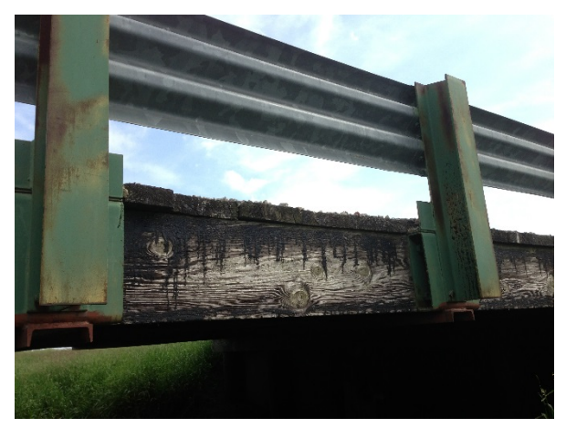
Fig. 10 Bremer 2 guardrail detail

From below, Blackhawk 5 was generally in pretty good condition. Noteworthy items include: some girders were found to have settled under load approximately 3 to 6 mm (0.125 to 0.25 in.) at the EOB; shimming was present at EOB between a couple abutment piles and the abutment cap; G19 had a plywood shim placed between it and the deck planks over its entire length as well as section loss due to a large splinter at midspan that was approximately 3-3.4 m (10-11ft.) in length. Girder G25 had the most significant deterioration. Hammer sounding, in addition to the ease with which the moisture meter pins could be inserted into the member, quickly identified a problem area that began at approximately 0.7 m (2 ft.) from BOB and extended to just past midspan. This area was investigated extensively with the stress wave timer and resistograph, the results of which are summarized below.