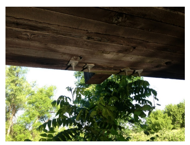
Fig. 12 Damage at connection detail between guardrail post and deck, Clarke 3

Clarke 3 has a gravel wearing surface that due to grading has all the scuppers partially to completely blocked. The most obvious signs of damage were at locations of physical connections, such as the guardrail post connections (see Fig. 12), and the longitudinal joint between deck panel sections where the lag screws have begun to push through the bottom of the deck and split the bottom of the member (see Fig. 13).