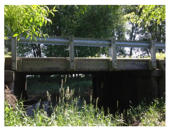
Fig. 4 Timber girder bridge elevation view from Cluster 2 in Blackhawk County

as toe nailed to the solid timber abutment caps. See Fig. 5 for a typical bridge layout.