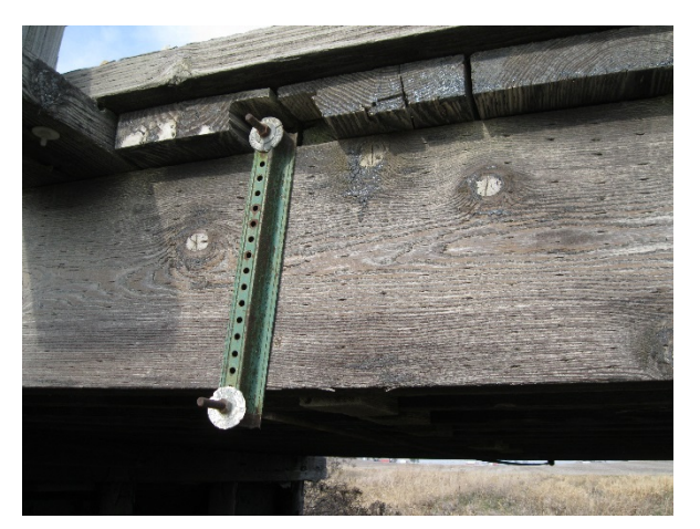
HOSTENG, WACKER, PHARES: Condition Assessment of Iowa Timber Bridges Using Advanced Inspection Tools