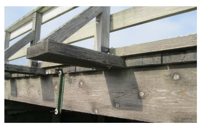
Fig. 8 Bremer 2 guardrail detail

Bremer 2 is situated in a shallow sag curve on 160^{\text{th}} St. and has a gravel wearing surface, although there were small signs of asphalt on the curbs. The deck planks were found to be in good condition, all seated well on the girders, and had gaps between adjacent planks of approximately 3 mm (0.125 in.) to 13 mm (0.5 in.). The guardrails were constructed of untreated dimension lumber which had been painted and were connected to the bridge by simply anchoring the rail posts on top of deck planks that were cantilevered off the edge of the bridge, see Fig. 8. This guardrail detail is not vehicle-impact sufficient and the members are showing sign of deterioration.