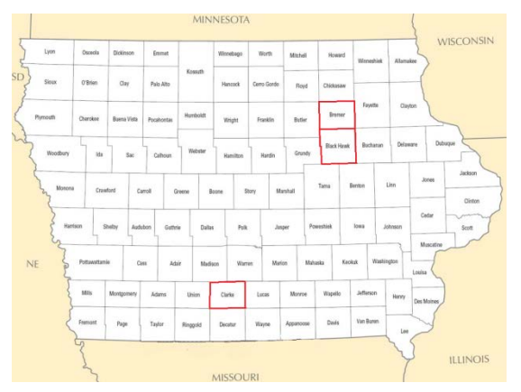
Fig. 1. Iowa county locations for inspections.