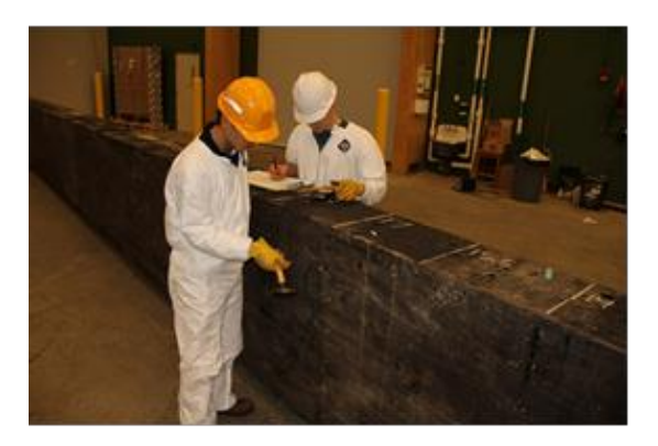
Figure 4. NDE testing is performed in the laboratory to detect internal decay.