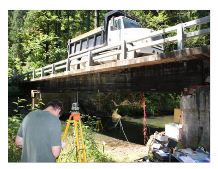
Figure 2. Optical level was also used to collect deflections from calibrated rules suspended from each girder.