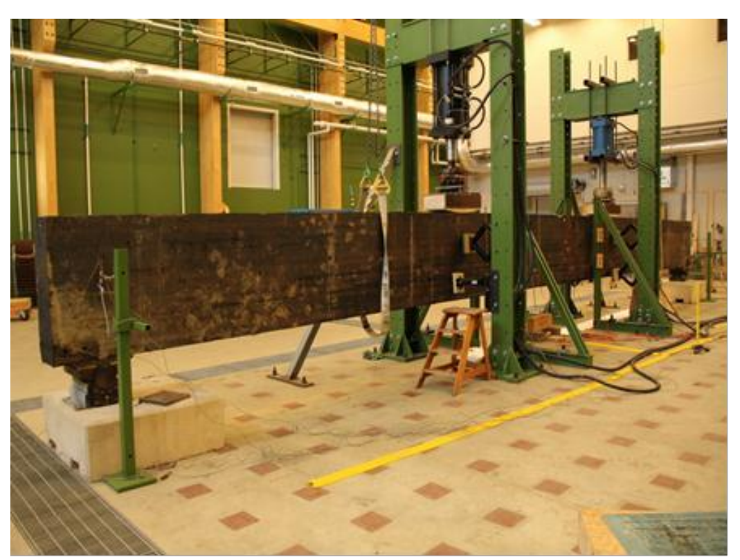
Figure 5. Static load testing was performed to determine member stiffness and ultimate load capacity of these 60-year-old salvaged glulam girders at the FPL Centennial Research Facility.

Testing results of four members showed that these pre-1970 manufactured glulam bridge girders had an average modulus of elasticity of 11,652 MPa ( 1.69 \times 10^6 \text{ lb/in.}^2 ) and failed at an average applied loading of 645 kN (145 Kips). These values are significantly higher than the original design stress level and suggest that the strength reduction factors may be overly conservative in some cases.