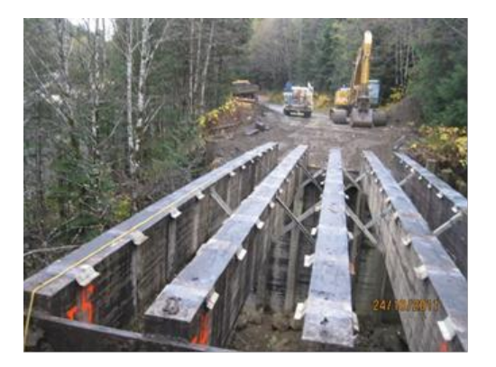
Figure 3. Pre-1970 glulam girders salvaged from site in Alaska.

After the 15.2m (50 ft) long glulam girders were removed from service at the Jenny Creek bridge site near Kake, Alaska (Figure 3), they were transported to the Forest Products Laboratory in Madison, Wisconsin. Several laboratory investigations were conducted in order to reliably determine the residual capacity of these early glulam bridge girders. Visual defects were physically mapped, in addition to extensive scanning using stress wave timing device in a perpendicular to grain orientation (Figure 4). Static load testing was conducted (Figure 5) using 4-point bending arrangement in order to produce a uniform bending moment through the midspan section of the bridge girders. Testing was first completed to measure the modulus of elasticity of each beam. Then loading to ultimate failure was performed over a 10-minute load duration target period.