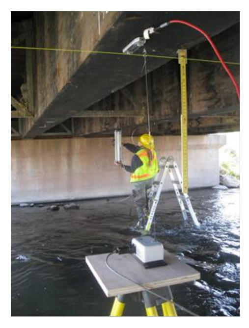
Figure 1. Live load testing data was collected via string potentiometers (deflection) and transducers (strain).

stress wave timer. The stress wave parallel-to-grain data was collected to correlate with stiffness values in the tension zone laminations. While the perpendicular-to-grain data were used to detect internal decay pockets. Resistance micro-drilling measurements were also taken at various locations in the tension laminations in order to gain a better understanding of their growth ring orientation and grade characteristics.