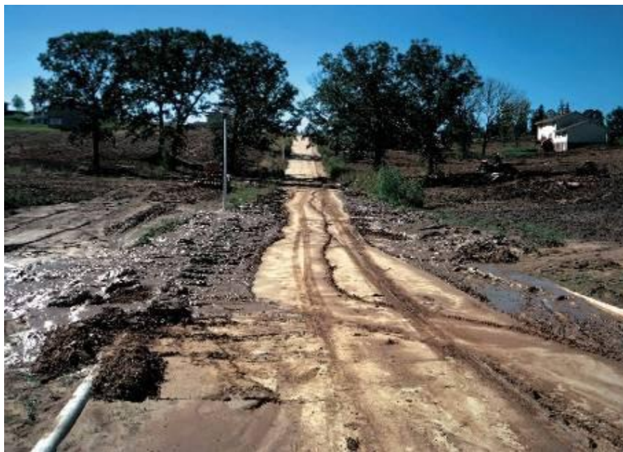
Figure 7D-1.01: Sediment in Street Due to Inadequate Erosion and Sediment Control During Construction

Sediment control practices are generally more expensive and less effective than providing proper erosion control. While sediment control structures can remove significant amounts of sediment from stormwater runoff, and should be implemented as part of the overall erosion and sediment control plan, they should be considered secondary to erosion control for the reasons described above.