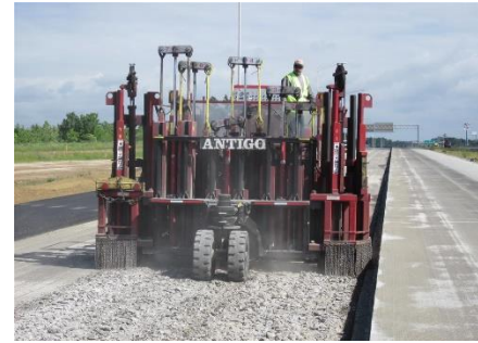
Rubblizing - Photo courtesy of Antigo Construction

It may be necessary to work with the rubblizing contractor to establish a 100 to 200 foot test section as a means of determining the effectiveness of the rubblization. The goal is to break the existing PCC pavement into pieces with a nominal maximum size of 4 inches. In certain circumstances, the designer may allow larger pieces but they should not exceed 12 inches in size and should only be allowed for a limited area. It may be appropriate to require the contractor to excavate a test pit (4 feet by 4 feet) to assure that the PCC has been fractured throughout its entire thickness and that the bond between any steel and the concrete has been broken.