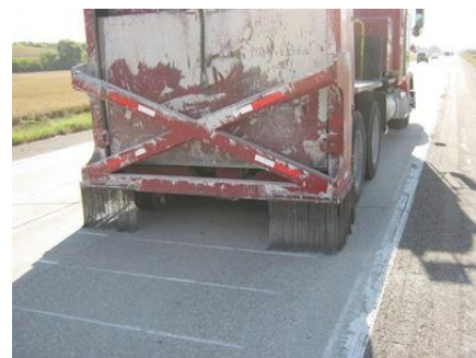
Crack and Seat

In urban areas, a full depth saw cut along the curbline is required prior to conducting crack and seat operations. In addition, a guillotine style breaker should be used with caution where structures are near the roadway. Impacts from the large single breaker can vibrate structures and cause concerns for property owners. A segmental breaker results in lower magnitude vibrations and is recommended for crack and seat projects in urban areas.