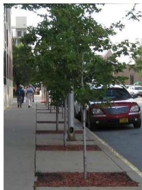
Figure 12A-3.01: Acceptable Pedestrian Area Figure 12A-3.02: Undesirable Pedestrian Area