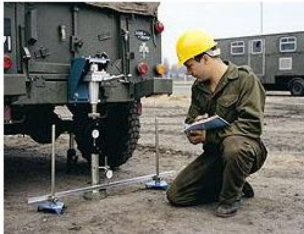
Figure 6E-1.01: In-situ CBR