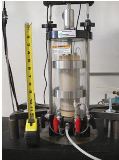
Figure 6E-1.03: Resilient Modulus

The purpose of using seasonal modulus is to qualify the relative damage a pavement is subject to during each season of the year and treat it as part of the overall design. An effective road bed soil modulus is then established for the entire year which is equivalent to the combined effects of all monthly seasonal modulus values. AASHTO provides different methodology to obtain the effective M_R for flexible pavement only. The method that was selected for use in this manual was based on the determination of M_R values for six different climatic regions in the United States that considered the quality of subgrade soils.