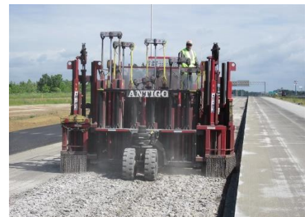
Rubblizing - Photo courtesy of Antigo Construction