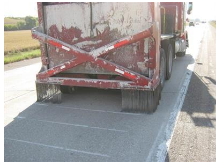
Crack and Seat - Photo courtesy of Antigo Construction

In urban areas, a full depth saw cut along the curblines and also around manholes and utility fixtures, such as water valves, is required prior to conducting crack and seat operations. In addition, a guillotine style breaker should be used with caution where structures are near the roadway. Impacts from the large single breaker can vibrate structures and cause concerns for property and utility owners. A segmental breaker results in lower magnitude vibrations and is