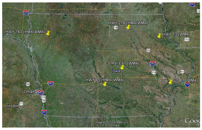
Roadway pavement locations for the WMA study

Phase I testing included indirect tensile strength, dynamic modulus, and flow number testing. Phase I conclusions indicated some differences between the WMA mix properties and HMA properties; however, trends were not present over all the mixes tested. Phase I showed differences between control HMA mixes and WMA mixtures in moisture conditioning and dynamic modulus performance.