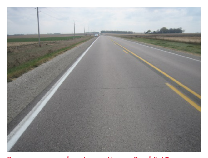
Pavement survey location on County Road E-67

Although beyond the scope of this study, the identified economic value of WMA technology is due to the reduction of plant temperatures by 50 to 100°F, fuel savings, the improved field compaction allowed (reduction in roller coverage), and/or shorter haul distances. The environmental benefits of WMA additives include reduced HMA plant emissions because of the reduced plant production temperatures, as well as reduced worker exposure to fumes during the production/construction process.